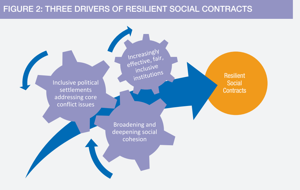
Figure 2 illustrates the three postulated 'drivers' of a resilient social contract: